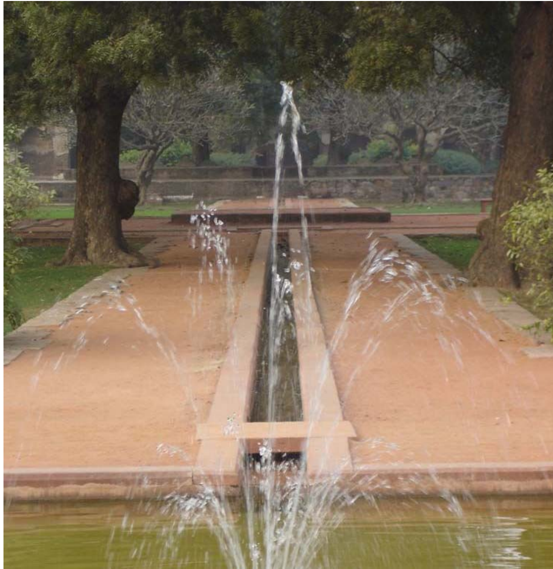
where man embraces nature