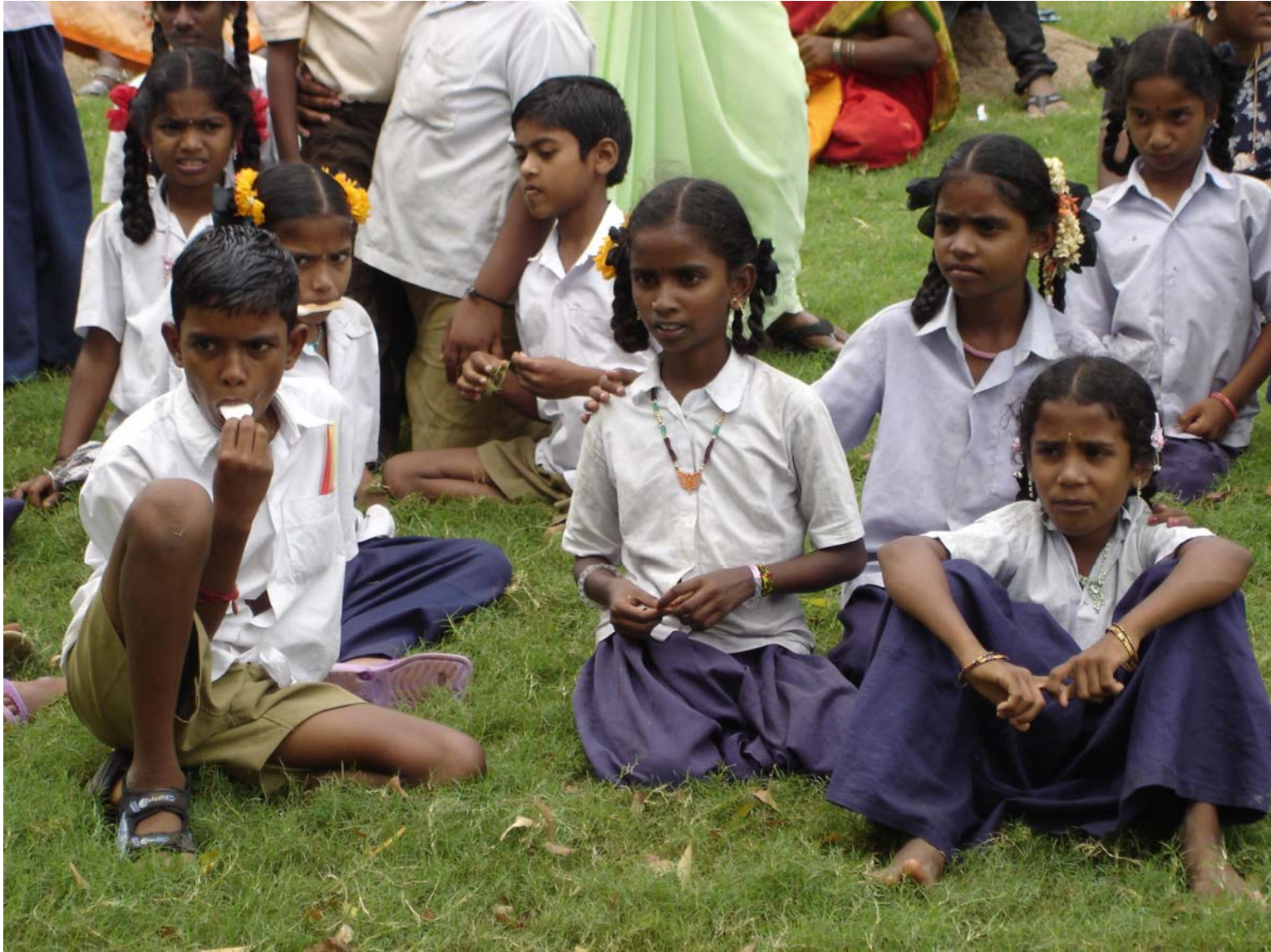
a moment of realization