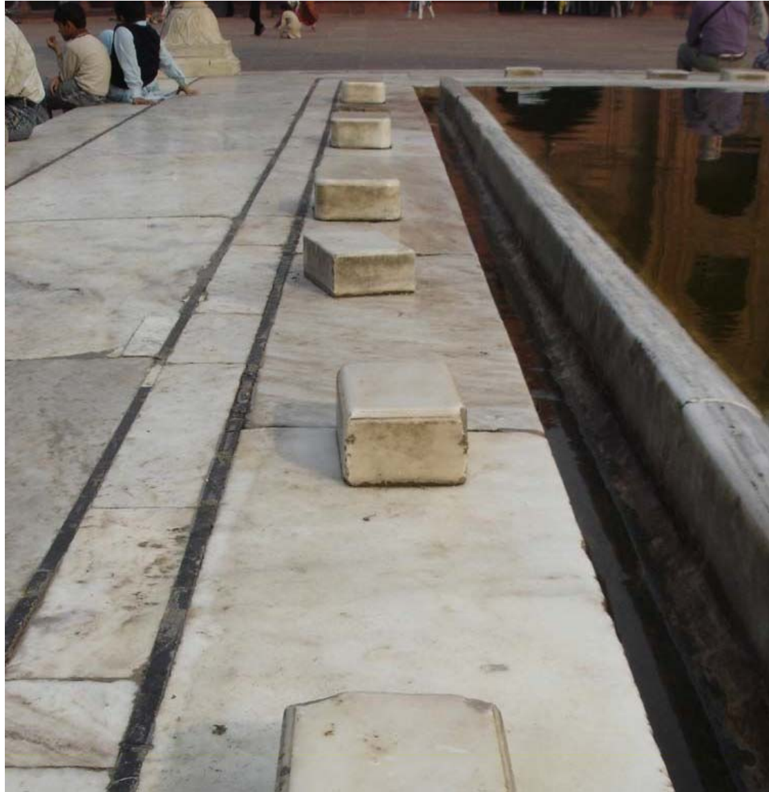
where architecture anticipates action