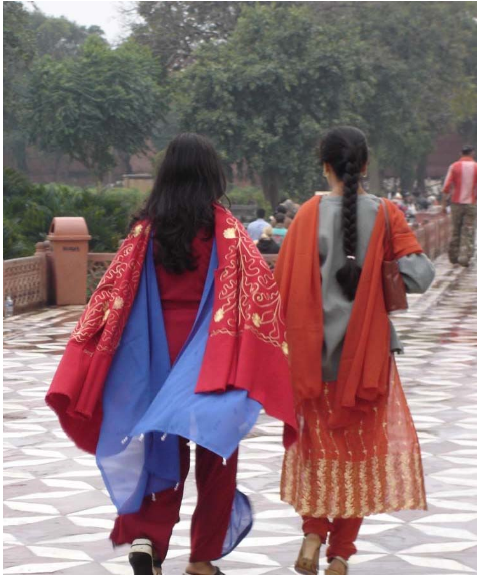
sacred space is a celebration of life