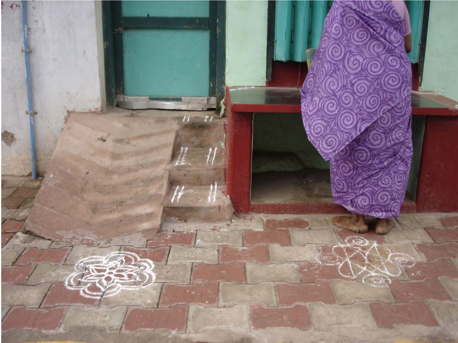
where a symbol can transform a place