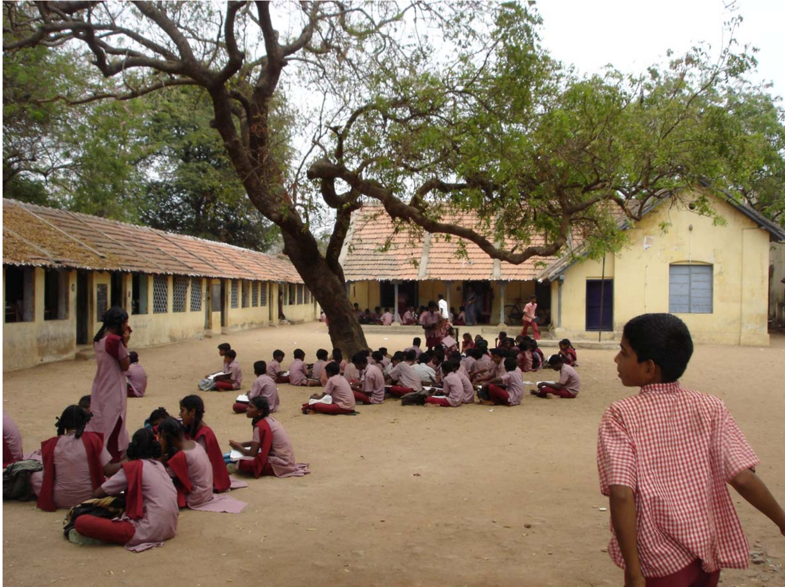
a collective experience