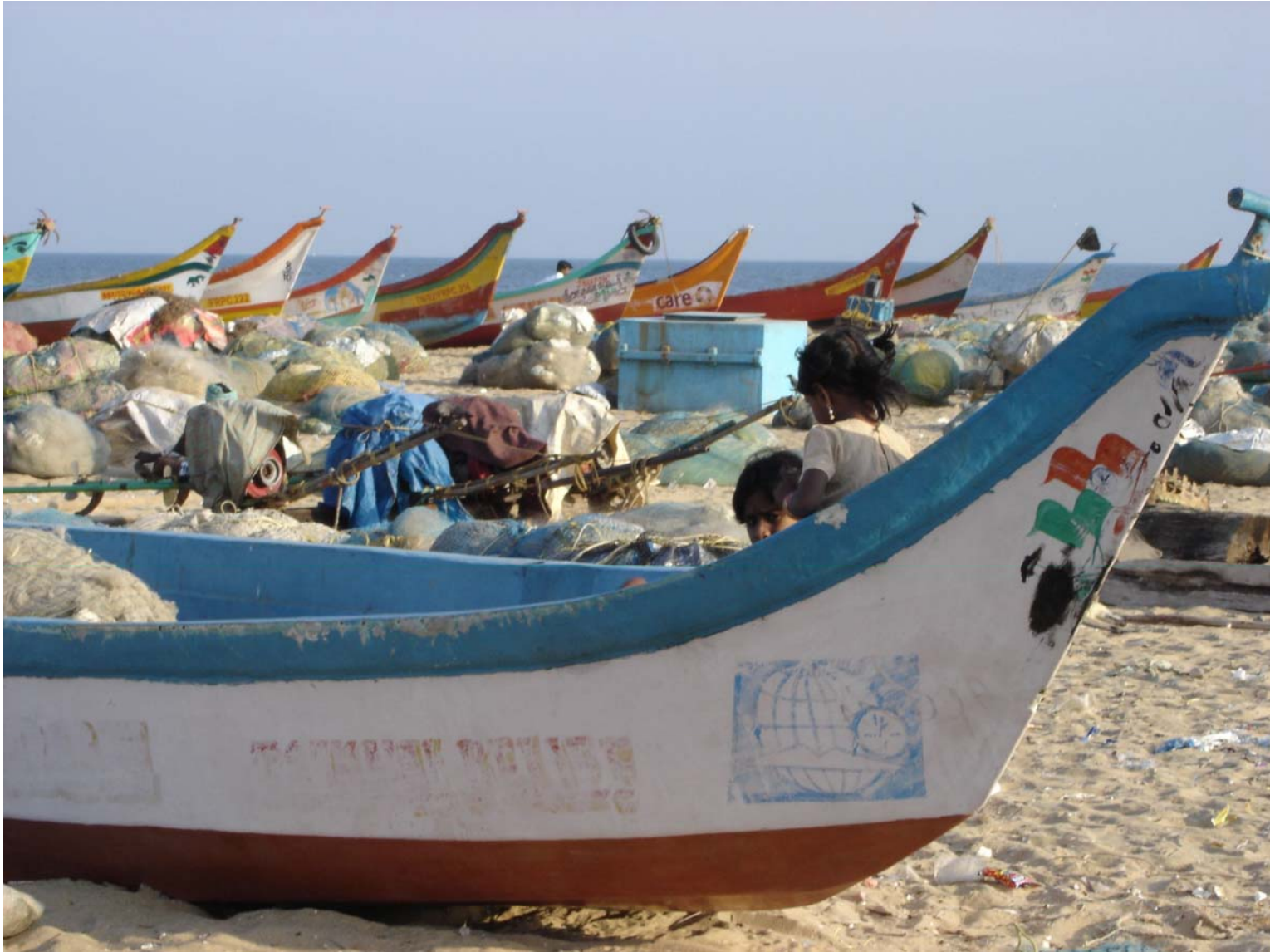
where we are awed by our own industry